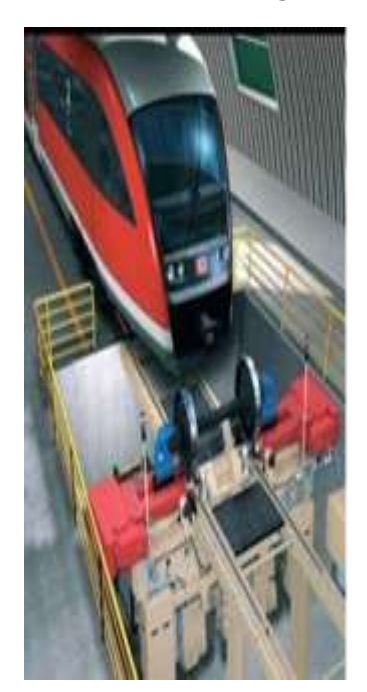
i)Lathe mounted below the ground level

Depending on the destination, several types of lathes were developed: mounted underground [7], fig. 3,a. or at ground level, placed on foundations. The first are generally used for rail wheel reshaping without dismounting the wheels from the vehicle.