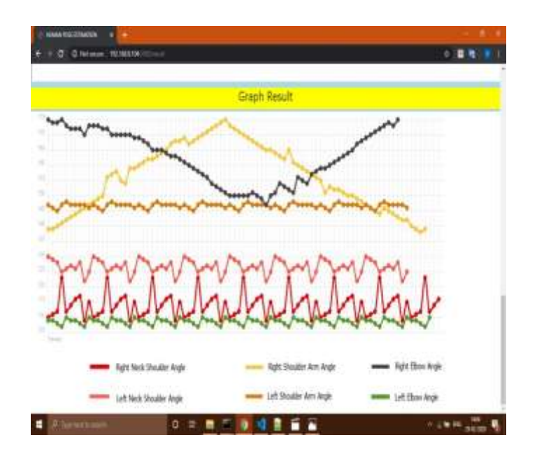
Figure-2: Graph describing the movements in the skeletal structure