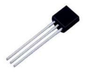
Fig7. Temperature sensor

The LM35 series are precision integrated-circuit temperature devices with an output voltage linearly-proportional to the Centigrade temperature. The LM35 device has an advantage over linear temperature sensors calibrated in Kelvin, as the user is not required to subtract a large constant voltage from the output to obtain convenient Centigrade scaling. The LM35 device does not require any external calibration or trimming to provide typical accuracies of \pm 1/4^{\circ} C at room temperature and \pm 3/4^{\circ} C Over a full -55°C to 150°C temperature range.