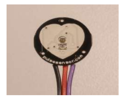
Fig5. Pulse rate sensor

Pulse rate Sensor is a well-designed plug in modeheartrate sensor for Arduino. It can be used to detect live heartrate data the sensor can be clipped into the fingertip or earlobe and it will be plugged right into the Arduino. It also includes an open-source monitoring app that graphs your pulse in real time. It consist of 24-inch Color-Coded Cable, with (male) header connectors this makes it easy to embed the sensor and connect to an Arduino [8]. The Velcro Dots are 'hook' side and are also perfectly sized to the sensor these Velcro dots are very useful to make a Velcro (or fabric) strap to wrap around. Transparent Stickers are used on the front of the Pulse Sensor to protect it from oily fingers and sweaty earlobes. The Pulse Sensor contains 3 holes around the outside edge which make it easy to sew it into almost anything [2].