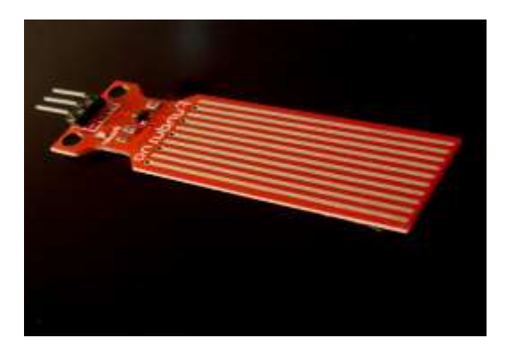
Fig6. Sweat sensor

Fourth one, it can directly connected to a microprocessor or other logic circuitry, and the controller board for a variety for example: Arduino Controller STC microcontroller, AVR microcontroller and so on. The operating voltage of the sensor is DC5v. Less than 20mA is the working current. This sweat sensor is an Analog type with dimensions of 40mm x 16mm detection area. The working temperature is around 10^{\circ} C to 30^{\circ} C.