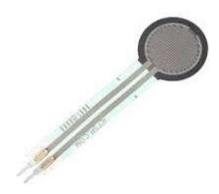
Fig3. Force sensor

Force Sensitive Resistors (FSR) 402 are a polymer thick film (PFT) device which exhibits a decrease in resistance with an increase in the force applied to the active surface. It allows to measure physical pressure, weight and squeezing. Its force sensitivity is optimized for use in human touch control of electronic device. FSRs are not a load cell or strain gauge, though they have similar properties. FSRs are not suitable for precision measurements. It is of 12.7 in diameter and 0.4mm thick.