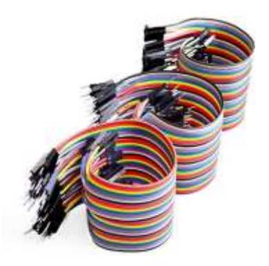
Fig-5: Jumper Wires

A jumper is an electrical wire, or group of them in a cable, which have a connector or pin at each end and it is normally used for making connections between items on your breadboard and your Arduino's header pins. In our project these are used to connect LED matrix and Wi-Fi module.