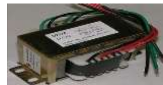
Fig3.6 Step up transformer

A transformer is static electrical equipment which transforms electrical energy to the magnetic energy and again to the electrical energy. Essentially, that is the main task of the transformer, converting from the low voltage and high current on the primary side to high voltage and low current on the secondary side and vice versa.