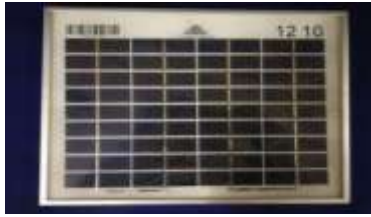
Fig-3.1 Solar Panel

3.2-Super Capacitor: Super capacitors are also called as ultra capacitors and electric double layer capacitor type available today. Capacitance values reaching up to 800 Farads in a single standard case size are available. Super capacitors can be charged and discharged quickly while batteries can supply the bulk energy since they can store and deliver larger amount of energy over a longer slower period of time.