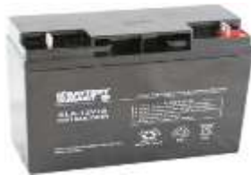
Fig-3.3 Rechargeable Battery

3.3-Rechargeable Battery: A rechargeable battery, storage battery, secondary cell, or accumulator is a type of electrical battery which can be charged, discharged into a load, and recharge many times, as opposed to a disposable or primary battery, which is supplied fully charged and discharged after use. It is composed of one or more electrochemical cells.