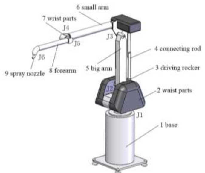
Fig -2: Three-dimensional model of 6-DOF spray painting robot [2]

The normal spray-painting robot also includes various parts like base, waist parts, driving rocker, connecting rod, small arm, wrist parts, forearm and spray nozzle in the last. We can see from figure 2; the entire stability of the spray-painting robot depends on the rigidity of base. So, base material should be capable enough to carry the entire weight and moment of the robot. We have to find the maximum load that will be available at the end of the robot in the worst condition.