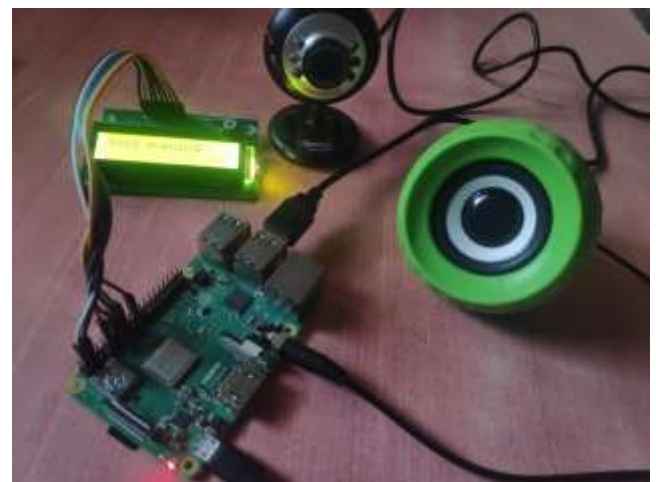
Fig.4 Hardware image of proposed system

The project consist of a controller which is Raspberry Pi 3 which does all the main function of the system in this case converting the voice into text and signs into text as well as voice. The LCD display is used for displaying the text which is converted by the controller. The speaker will give the output as voice. The camera is used for receiving the signs which gets processed through the