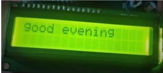
Fig.4 Output of LCD

The output will be obtained as text as well as voice. The text output will be obtained through the LCD display and the voice output will be obtained through the speaker.