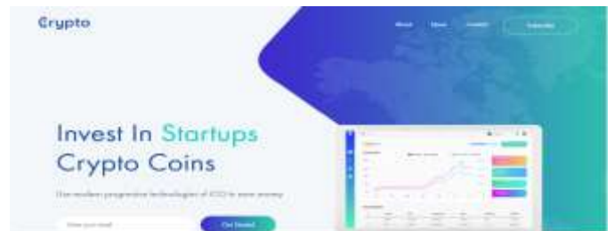
Fig. 6.1 User Interface