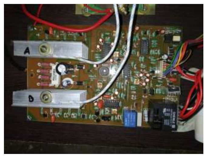
Fig 2: Actual Working Model fig 1