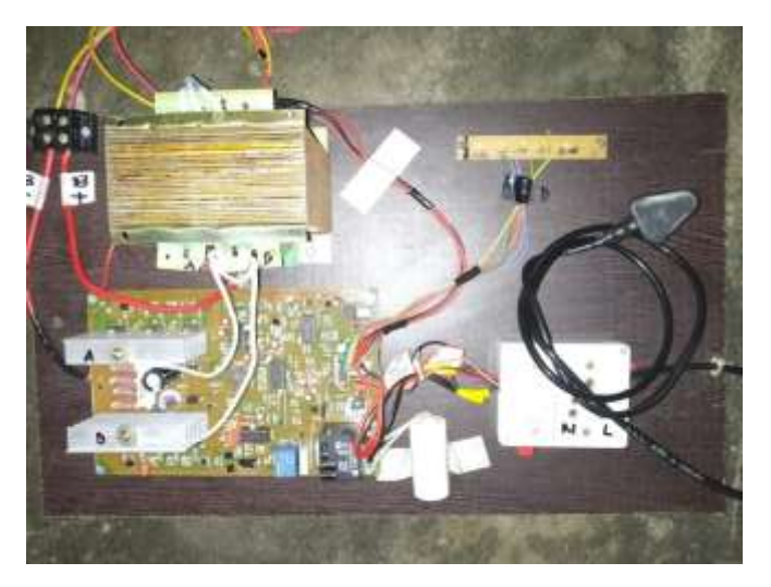
Fig 3: Actual Working Model fig 2