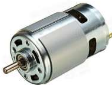
Fig: DC Motor

The DC motor is a machine that transforms electric energy into mechanical energy in form of rotation. Its movement is produced by the physical behaviour of electromagnetism. DC motors have inductors inside, which produce the magnetic field used to generate movement.