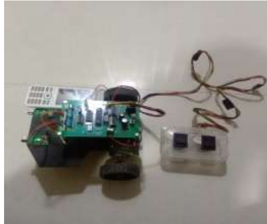
Fig: Assembled Robotic Car

After all the connections are connected to micro-controller and other components to each other and checking all the connections. When the Robotic car is ready to work properly start the micro-controller by switching the ON the button. There are four modes are available i.e. avoidance and detection, line follower, wired remote controller, mobile as a controller.