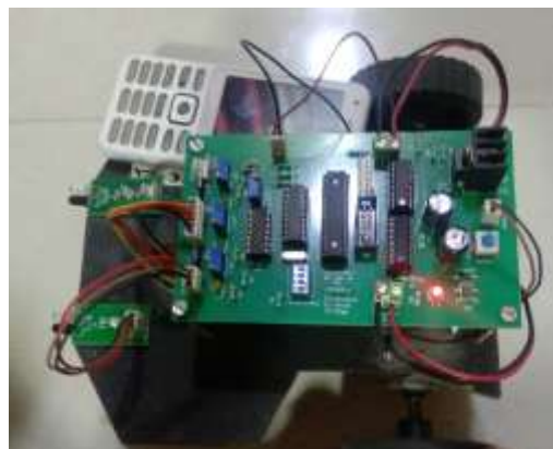
Fig: Detecting and avoiding function

After choosing any of them such as we choose detection and avoidance of obstacles then the Robotic car will detect the obstacles like anything it can be human or stones or trees anything, it will avoid and move forward to its destination if there is no way to move forward then it will move backward and find the way to move on.