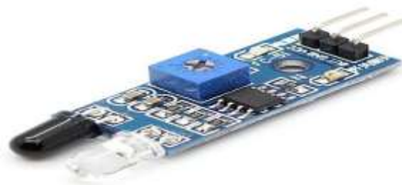
Fig: IR sensor

An infrared sensor is an electronic device, that emits in order to sense some aspects of the surroundings. An IR sensor can measure the heat of an object as well as detects the motion.