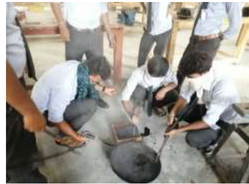
Fig 3.1 Casting of pavement block