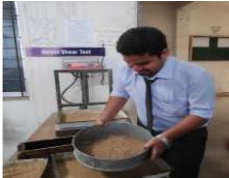
Fig 3.6 Mix Design