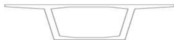
Single cell box girder

Box girder cross sections may take the shape of single cell (one box), multi-spline (separate boxes) or multi-cells with a standard bottom flange. Box girders offer better resistance to torsion, which is especially of benefit if the bridge is curved in plan. because of the high torsional stiffness of the closed cross section of the box girders, which frequently ranges from 100 to 1000 times larger than the torsional stiffness of comparable I-shaped sections, the torsional moment induced by the curvature of the girder may be resisted by the box beam. The fabrication of the box beam is dearer compared to the I-shaped girder, but this extra cost is sometimes balanced by the reduction in sub structuring for the box beam, the highest of the box beam will work because the deck. Additionally, for long span bridges, where the segmental method of construction is chosen, prestressed concrete box girders have proved to be economical. The box beam comprises various sorts of geometries and forms, but the cross-section can generally be divided into single-cell, multi-cell or spread box beams as shown in figure 1