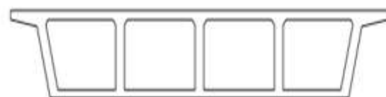
Multi cell box girder