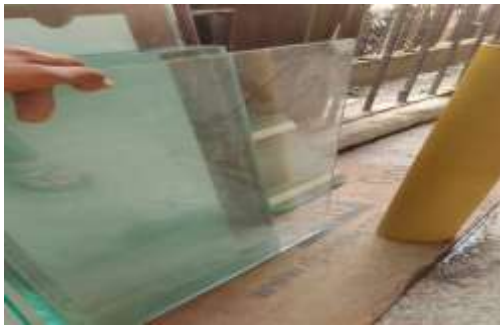
Fig -3: Two-Way Mirror