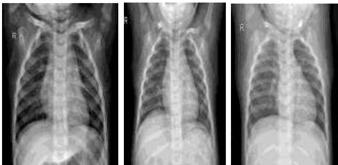
Fig. 1. Normal CXR images

In this research, CXR images are obtained from the Kaggle website. The dataset [19] consists of three main folders training, testing, and validation and each contains two subfolders pneumonia (P) and normal (N) chest X-ray images. No of Pneumonia images are 4,273, and Normal images are 1,583, a total of 5,856 X-ray images of anterior-posterior chests are there.