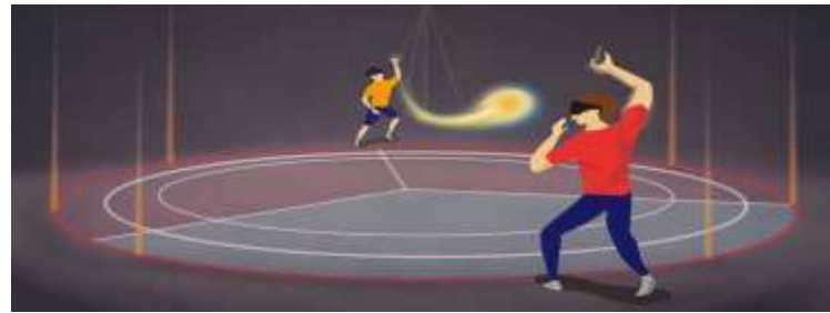
FIGURE 1: Our vision of the Floating Ball Concept, visualized with two players competing against each other in the augmented world