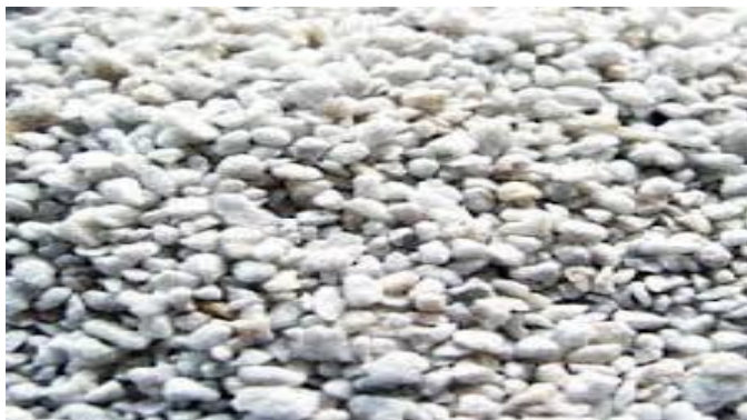
Fig. 9 Expanded Silica, Or Perlite

Insulation material composed of natural or expanded perlite ore to form a cellular structure; material has a low shrinkage coefficient and is corrosion resistant; non-combustible, it is used in high and intermediate temperature ranges. Available in pre-formed sections and blocks.