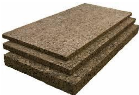
Fig. 1. Cork