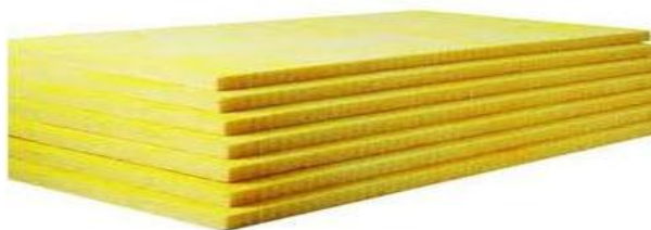
Fig. 5 Glass mineral wool

Made from molten glass, usually with 20% to 30% recycled industrial waste and post-consumer content. The material is formed from fibres of glass arranged using a binder into a texture similar to wool. The process traps many small pockets of air between the glass, and these small air pockets result in high thermal insulation properties. The density of the material can be varied through pressure and binder content.