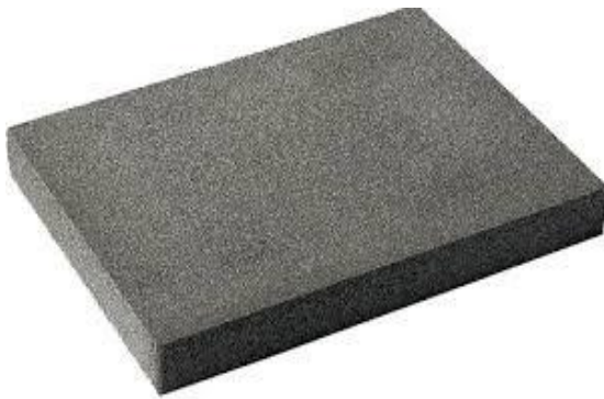
Fig. 8 Cellular Glass