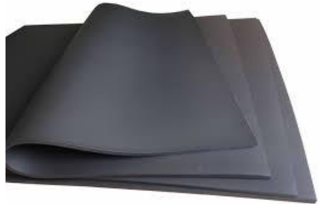
Fig. 10 Elastomeric Foam

Foamed resins combined with elastomers to produce a flexible cellular material. Available in pre-formed sections or sheets, Elastomeric insulation offer water and moisture resistance. Upper temperature limit is 105 °C. Product is resilient. Fire resistance should be taken in consideration.