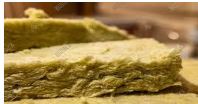
Fig. 7 Mineral Fiber

Rock and Slag: Rock and slag fibers are bonded together with a heat resistant binder to produce mineral fiber or wool. Upper temperature limit can reach 1035°C. The same organic binder used in the production of glass fiber products is also used in the production of most mineral fiber products. Mineral fiber products are non-combustible and have excellent fire properties.