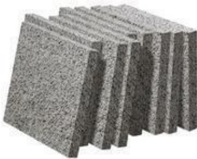
Fig. 13 Insulating Cement

Insulating and finishing cements are a mixture of various insulating fibers and binders with water and cement, to form a soft plastic mass for application on irregular surfaces. Insulation values are moderate. Cements may be applied to high temperature surfaces. Finishing cements or one-coat cements are used in the lower intermediate range and as a finish to other insulation applications.