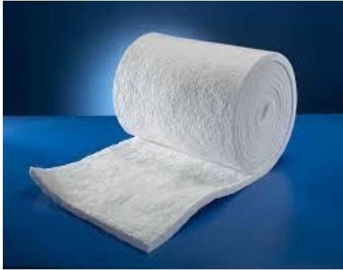
Fig. 12 Refractory Fiber

right and is not treated fully in this manual, although some refractory products can be installed using application methods illustrated here.