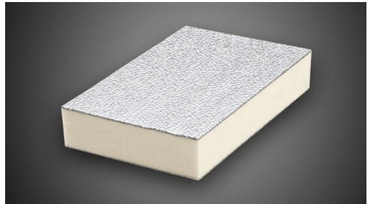
Fig. 2. Polyurethane

It is form by reaction between iso-cyanates and polyols. The insulation material is produced as boards or continuous on production line. Its thermal conductivity value for pur are between 0.020 and 0.030 w/(m.k).i.e. it is lower than mineral wool, polystyrene and cellulose product.