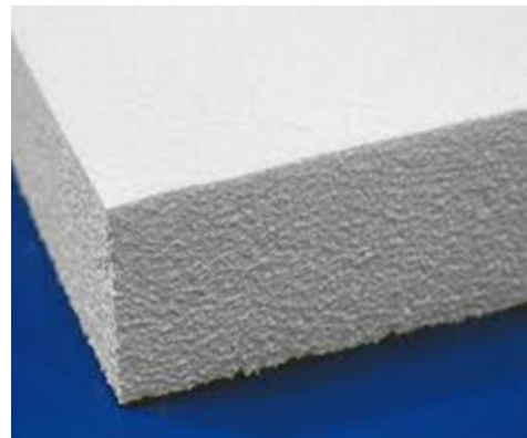
Fig. 11 Foamed Plastic

Insulations produced from foaming plastic resins create predominately closed cellular rigid materials. "K" values decline after initial use as the gas trapped within the cellular structure is eventually replaced by air. Foamed plastics are light weight with excellent cutting characteristics. The chemical content varies with each manufacturer. Available in pre-formed shapes and boards, foamed plastics are generally used in the lower intermediate and the entire low temperature ranges. Consideration should be made for fire retardancy of the material.