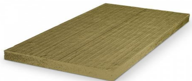
Fig. 3 Expanded Polystyrene

Polystyrene product are made of organic cellular plastic for insulation purposes, polystyrene is commercially produced in two forms expanded polystyrene and extruded. Thermal conductivity of EPS are between 0.030 and 0.040 W/(m.K) and thermal conductivity of XPS are between 0.025 and 0.035 W/(m.K).