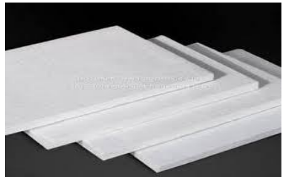
Fig. 6 Calcium silicate