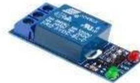
Fig -5: Relay

a set of operating terminals. In this two single channel relays is used to control the high current in the circuit into a low current signal.