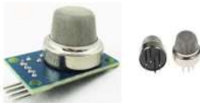
Fig -3: Gas detector

A Gas detector is a device that detects the presence of gases in an area, often as part of a safety system. It is used to detect toxic gases and oxygen depletion. This type of device is used widely in industry and can be found in locations, manufactures process and emerging technology such as photovoltaic.