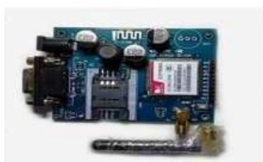
Fig -5: GSM Module

The abbreviation of GSM is Global System for Mobile. It is widely used for mobile communication system. GSM is an open and digital cellular technology used for transmitting mobile voice and data services[3]. The digital system has an ability to carry 64kbps to 120kbps of data rates. It uses encryption to make phone calls more secure. The SIM card