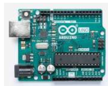
Fig-2: Arduino Uno

The Arduino Uno is an open source microcontroller board based on the microchip ATmega328p. The board is equipped with sets of digital and analog input/output. The board has 14 digital I/O pins, 6 analog I/O pins and is programmable with the Arduino IDE. The input voltage should be 7 to 20 volts and its operating voltage is 5volts.