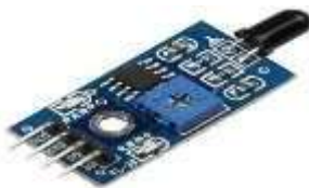
Fig -4: Flame sensor

Flame sensor consists of photodiode used to receive the infrared radiation which is emitted during the fire. There are 4 pins system. Supply voltage range is 3.3v to 5.3v. The flame detection can be done from a 100cm distance and the detection angle will be 60°. The output of the sensor is an analog or a digital signal.