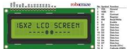
Fig -6: LCD Display

Liquid crystal display is composed of several layers which include two polarized panel filters and electrodes. It has 16 pins. LCD technology is used for displaying the image in notebook or some other electronic devices like mini computers. Light is projected from a lens on a layer of liquid crystal.