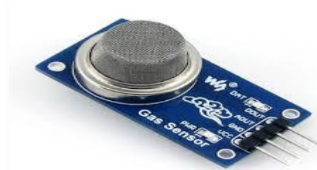
Fig-1 Smoke sensor used in the proposed system.

Forest fire detection using IoT and neural network. we designed sensor nodes for fire monitoring employing multi-sensors such as temperature, humidity, smoke, and flame.An Arduino UNO atmega328p micro-controller is used to embed the sensors. For gathering heat and humidity measurements, DHT22 is used which gives us two important measurements required for a smart fire monitoring system. The LED light shows the presence of fire.