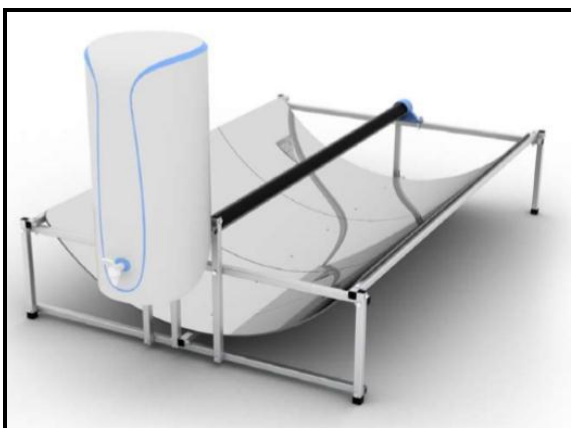
FIG NO. 2: CAD MODEL OF DESALINATION PLANT