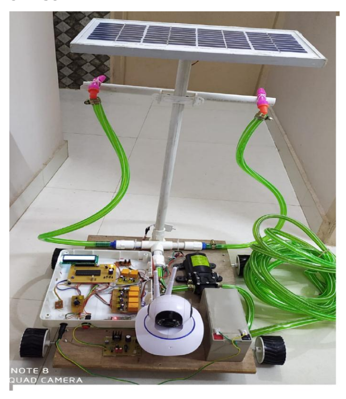
Fig 3: Project module

We use Bluetooth module to control the direction of robot. If we press forward, reverse, left, right buttons then robot will move in forward, reverse, left, right direction respectively. If we will press the spray buttons then sprinkler will spray the pesticide. All situations are captured by the camera.