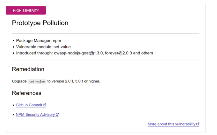
Fig -4: Vulnerability reported by Snyk (set-value module)