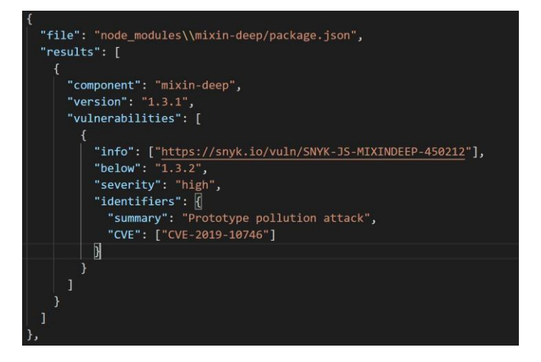
Table 2. lists out the vulnerable node modules reported by both the tools in NodeGoat project. Both tools reported the same version of component as vulnerable showing they have a consistent database for these modules.