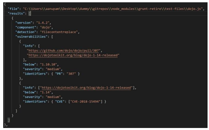
Fig -6 : Vulnerable JavaScript library dojo.js reported by Retire.js

Table -4: Vulnerable JavaScript libraries found by Retire.js