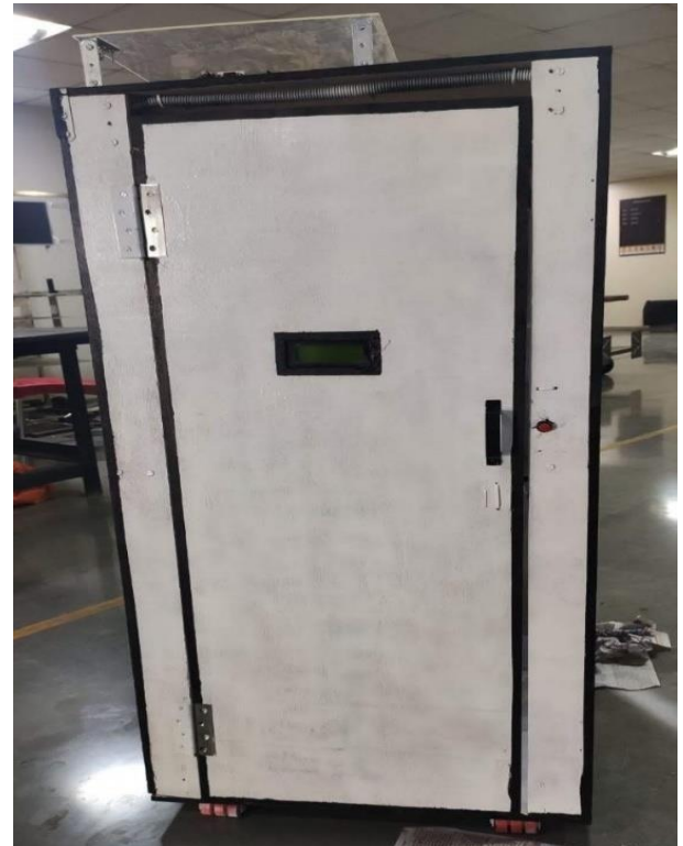
Fig 2. Outer view of the model