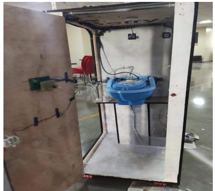
Fig 3. Inner view of the model