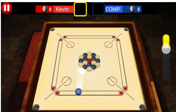
Fig -2: Working of Multiplayer Carrom Board Game