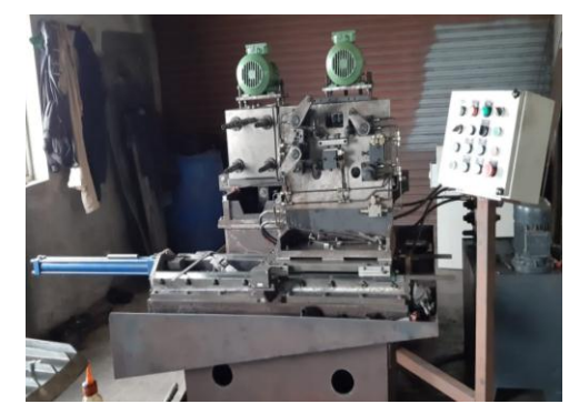
Fig.No.2 Machine Setup