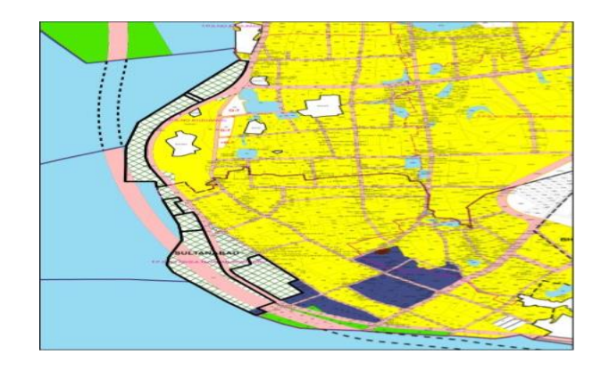
Fig. 1 Map of Surat

The figure 1 shows the map of Surat city and highlight the area of Dumas beach. The highlighted area in figure 2 shows the area of Dumas. And pink outer boundary shows the proposed 120 m wide road I development plan 2035.