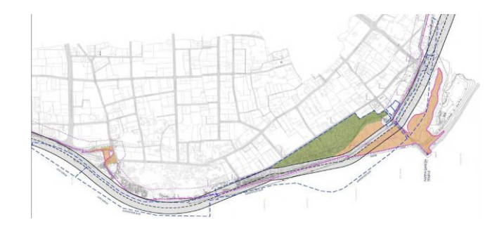
Fig. 3 Area of selected site

The figure 1 shows the map of Surat city and highlight the area of Dumas beach. The highlighted area in figure 2 shows the area of Dumas. And pink outer boundary shows the proposed 120 m wide road I development plan 2035.