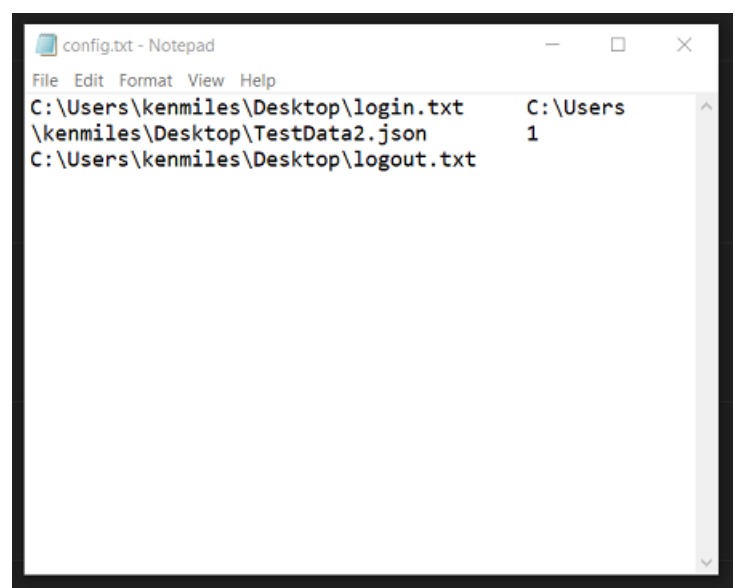
Fig -1: Config text file