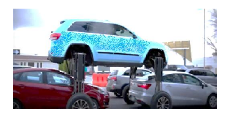
Fig -3: PLUS Wagon

As it was very difficult for the ambulances to reach the hospitals on time, we've come with the solution in which we've manipulated the structure of the ambulance by inducing some additional technologies to: