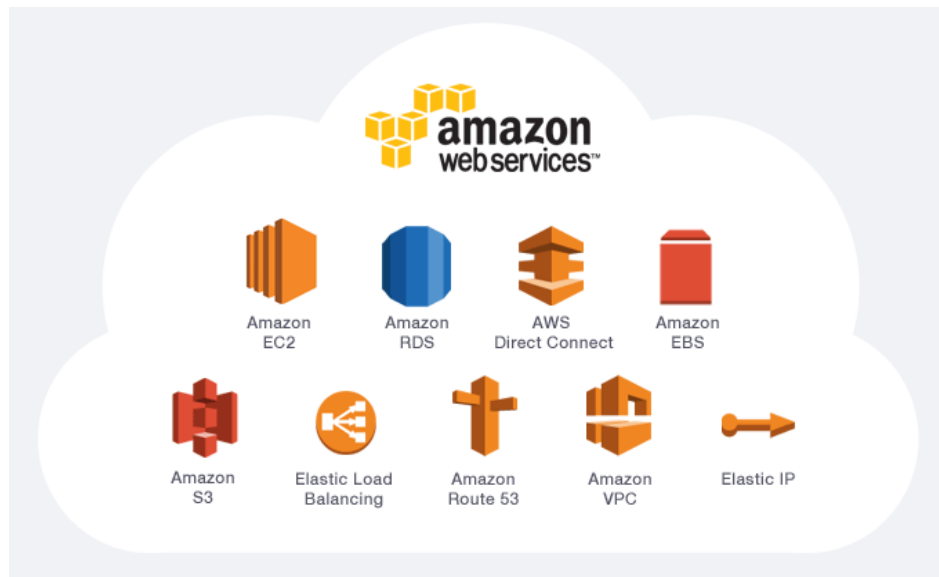
Fig -2: Amazon Web Services