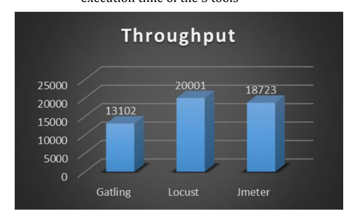
Fig 5: Comparison throughput of the 3 tools

The charts clealy show that Locust has highest throughput, and lowest response and execution time in this particular scenario. Locust is followed by JMeter, and then comes Gatling.