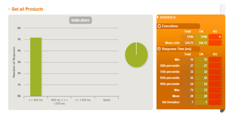
Fig. 1: Sample gatling report screenshot