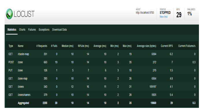
Fig. 2: Sample Locust report screenshot

Volume: 07 Issue: 05 | May 2020 www.irjet.net p-ISSN: 2395-0072