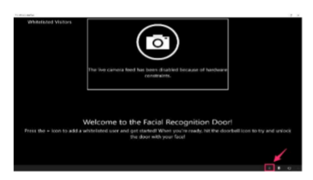
Fig -1: Adding user images into whitelist.

Volume: 07 Issue: 05 | May 2020 www.irjet.net p-ISSN: 2395-0072