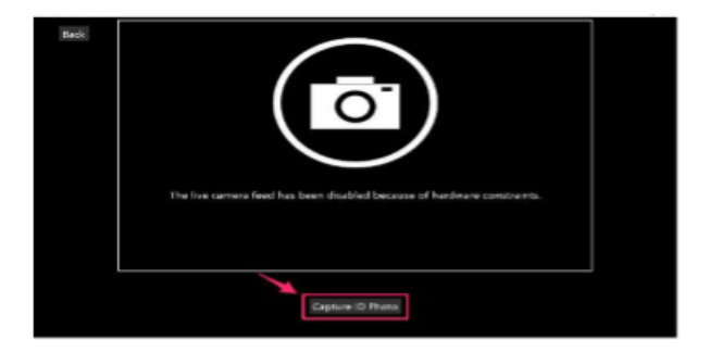
Fig -2: Capturing images into whitelist