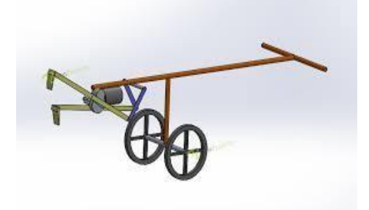
Fig -2 Fabrication Diagram