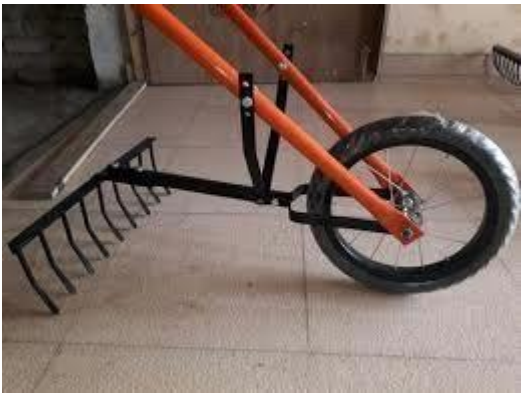
Fig 3.5 MANUAL WHEEL HOE WEEDER

In its primitive form, a wheel is a circular block of a hard and durable material at whose center has been bored a circular hole through which is placed an axle bearing about which the wheel rotates when a moment is applied