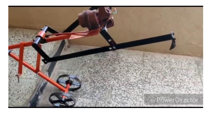
Fig 4.2 EXPERIMENTATION WORK

5. Hence weeding is done with less effort and less cost.