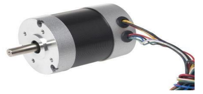
Fig 3.1 BRUSHLESS DC MOTOR

A brushless DC electric motor (BLDC motor or BL motor), also known as electronically commutated motor (ECM or EC motor) and synchronous DC motors, are synchronous motors powered by direct current (DC) electricity via an inverter or switching power supply which produces electricity in the form of alternating current (AC) to drive each phase of the motor via a closed loop controller. The controller provides pulses of current to the motor windings that control the speed and torque of the motor. The advantages of a brushless motor over brushed motors are high power-to-weight ratio, high speed, electronic control, and low maintenance. Brushless motors find applications in such places as computer peripherals (disk drives, printers), hand-held. The construction of a brushless motor system is typically similar to a permanent magnet synchronous motor (PMSM), but can also be a switched reluctance motor, or an induction (asynchronous) motor, power tools, and vehicles ranging from model aircraft to automobiles.