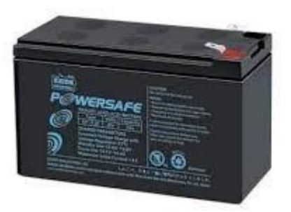
Fig 3.6 BATTERY