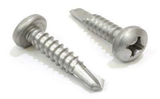
Fig 3.2 SCREWS

A screw is a type of fastener, in some ways similar to a bolt (see Differentiation between bolt and screw below), typically made of metal, and characterized by a helical ridge, known as a male thread (external thread). Screws are used to fasten materials by digging in and wedging into a material when turned, while the thread cuts grooves in the fastened material that may help pull fastened materials together and prevent pull-out. There are many screws for a variety of materials; those commonly fastened by screws include wood, sheet metal, and plastic.