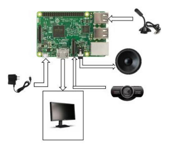
Figure 1.2: Connection between Raspberry Pi and I/O Devices.

Figure 1.1 explains about working of smart mirror. In this Raspberry pi acts as a CPU, which process the information fetched from the sensor and cloud, process, executed actions are performed by actuator. Cloud acts as a data center, where all the related information is fetched based on the IP address using HTTP protocol to the Raspberry pi. When the camera detects and recognize the person smart mirror initialize its working, which displays all the relevant information clock, calendar and events, newsfeeds, compliment, whether forecasting, weekly schedule, mobile notification, To-do list etc. Smart mirror can be interfaced through mic module to get the information from the cloud which is relevant for the user. When the user speaks to the voice assistant, the microcontroller connects to the cloud using IP address and give the information required to the person. The challenging task is to display the processed information from the cloud the display unit is work on electron browser. Electron browser is a framework which is used for desktop application.