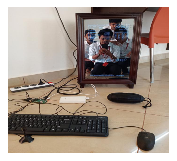
Figure 1.3: Mirro-Cool Smart Mirror prototype

Mirro-Cool Smart Mirror gives information of time, date, weekly schedule, accurate temperature and humidity, Mobile notifications, To-do list, Music, compliments and latest news while looking and grooming in front of mirror.