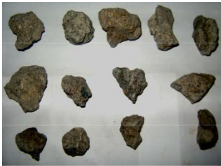
Fig.1 Sample of RCA with cement paste residue