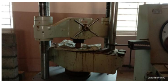
Fig -1: Testing compressive strength of geopolymer mortar after fire exposure