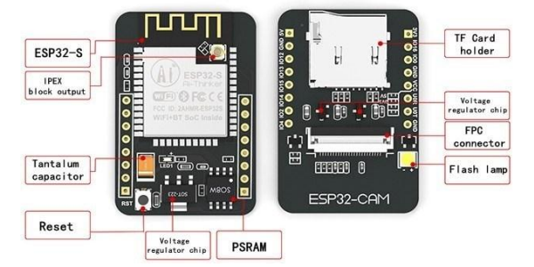
Fig(1)- ESP-32 CAM features

ESP-32 CAM has following features like- TF card holder, reset button, tantalum capacitor IPEX block output, FPC connector, flash Lamp, voltage regulator chip, PSRAM and other several features which are very helpful in monitoring purpose.and also the monitoring view would be very clear.