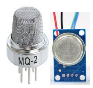
Fig(4) -MQ2 Smoke sensor

e-ISSN: 2395-0056 Volume: 07 Issue: 05 | May 2020 www.irjet.net p-ISSN: 2395-0072