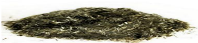
Fig -1: Chopped Golden Brown Basalt Fiber

Chopped basalt fibers has more surface area therefore it can easily dispersed to concrete and make more compact structure with high compressive strength and shear strength at low percentage of fiber addition. In the current work chopped golden brown basalt fibers with aspect ratio 730 is used.