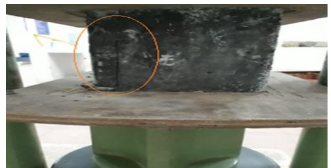
Fig- 3 : Failure of fiber reinforced concrete with 0.25% addition

Two sets of Deep beams including with and without fiber addition are casted. Dimensions and reinforcement details are listed below.