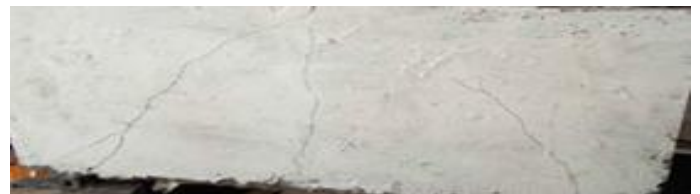
Fig- 8: Cracking behavior of BFRC deep beam

The control deep beam, after loading a small crack observed at the bottom of the deep beam which is called first crack or flexural crack. When the loading gradually increases then no. of crack pattern also increases. At last shear cracks begins to form near the supports and extend towards load position. The width of diagonal crack can be easily understand with the help of naked eye. Instead of this basalt fiber reinforced concrete deep beam shows better performance than previous one. Because the width of diagonal cracks cannot be understand with the help of naked eye. Number of flexural cracks are very less.