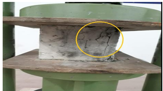
Fig- 2 : Failure of plain concrete

Concrete cubes of 150mm edge size with fiber addition of 0%, 0.15%, 0.2%, 0.25%, and 0.3% are prepared and find optimum chopped basalt fiber percentage in concrete.