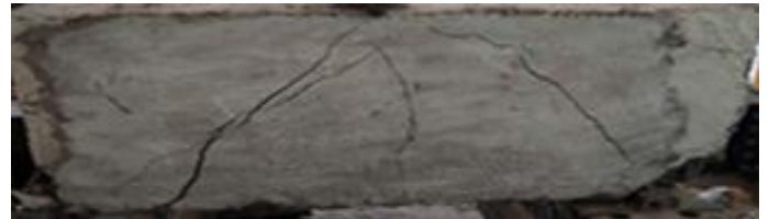
Fig -7 : Cracking behavior of normal deep beam

The specimens casted were tested on loading frame. The two specimens were tested at simply supported end conditions with a point load. In this experiment the performance of two beams were compared in terms of number of cracks, initial cracking behavior, ultimate conditions etc. The performance of two beams can be easily understand with the help of following figures and table