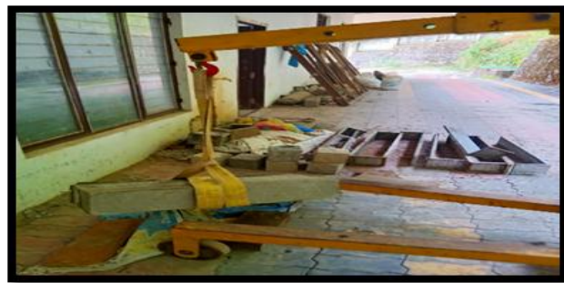
Fig -5: Deep beam specimen