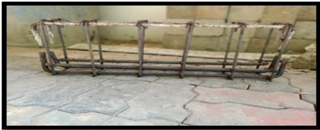
Fig- 4: Reinforcement Cage