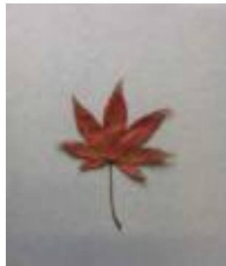
Figure -4: Resize Image

We have to convert image to specific size to work on image efficiently. User can give input image of various size, so we have to convert it into specific size. Resizing also helps to make image size minimal which helps in getting output image quickly.