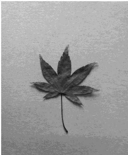
Figure -2: Greyscale Image

We convert image to grayscale to avoid excess of work on system. So, we can get our output quick.