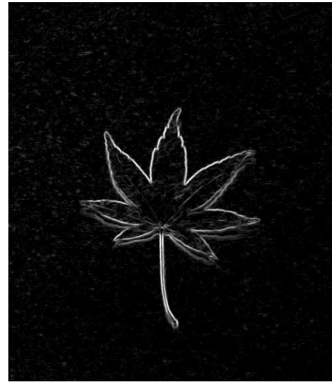
Figure -3: Edge of Image

We convert image to grayscale to avoid excess of work on system. So, we can get our output quick.