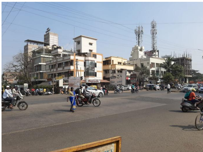
Fig-3: Lishan Hotel