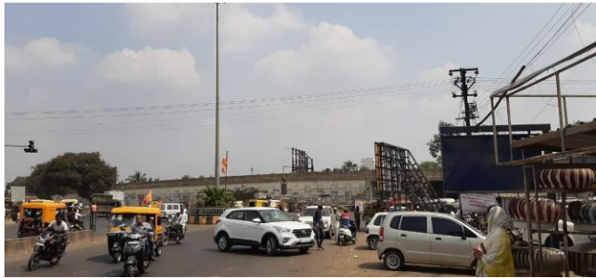
Fig-2: Tavade Hotel Area (Kolhapur Gate)