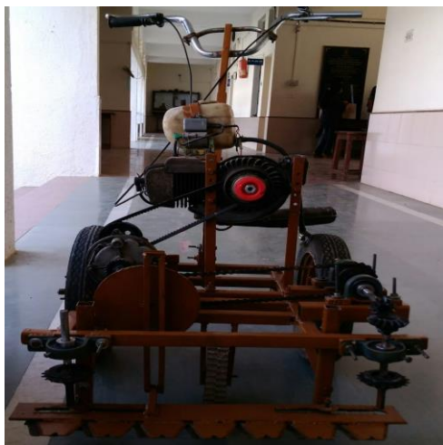
Fig 1. PASMA Multi-crop cutter (front view)