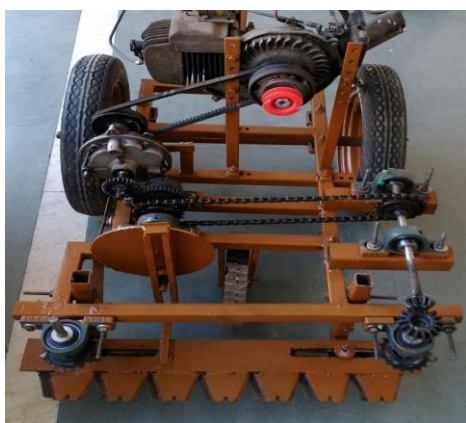
Fig 2. PASMA Multi-crop cutter (top view)