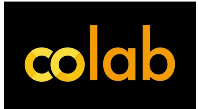
Fig -3: Google Collaboratory

Google Collaboratory is a google research project which is built to help education of Machine learning and Particularly Data Science. It is on Google Cloud.