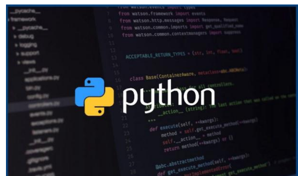
Fig- 1: Python

Implementing ML algorithms can create a huge mess if not it gets sophisticated with any other low-level language. With python there are already build libraries and python environments to create robust and maintainable ML codes