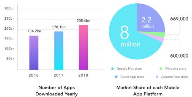
Fig -1: Mobile App Development - Infographic with Statistics [2].

platform mobile development, it is found that active research on a large number of topics is done that includes the performance of cross-platform frameworks and tools, development approaches, technical comparisons, study on user experience and analysis of cross-platform applications. This paper presents the relatable work like such previous studies and researches where it compares two cross-platform frameworks Xamarin and PhoneGap based on criteria. Further, each framework is described in detail.