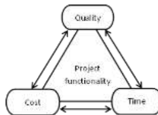
Fig -1: VM with manage-Time, Cost, Quality

Value management: Identifies the methodology and a technique used in value work, but does not distinguish between engineering of a building analysis of the project.