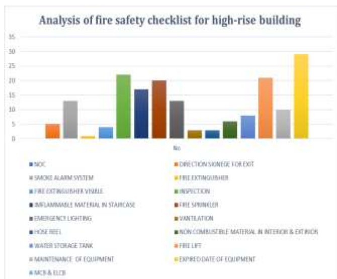
Fig: 4 Negative result of data tabulation

The below graph state that, residential and commercial high-rise buildings not having a proper result of, smoke alarm system, inspection, inflammable material in staircase, fire sprinkler system, fire lift, expired date of equipments, maintenance of equipments, hose reel, direction signage of exit, non-combustible material in interior and exterior.