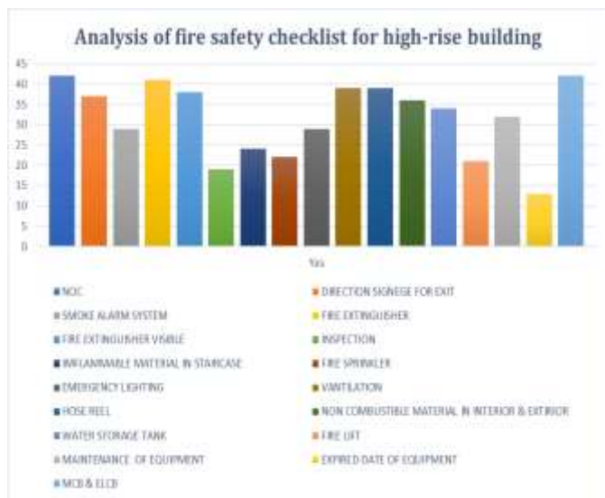
Fig: 3 Positive results of data tabulation

the buildings. The below graph shows the positive results of the analysis.