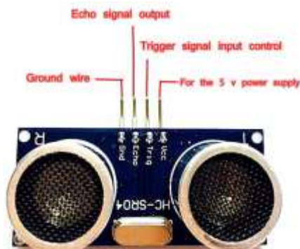
Fig -2: HC-SR04 Ultrasonic Sensor

It works in the range of 2-400cm in 15° effective measuring angle. It has 4 pins, one for +5V power supply, one neutral, or ground pin, one signal pin to trigger the transmitter and one echo pin to obtain the results.