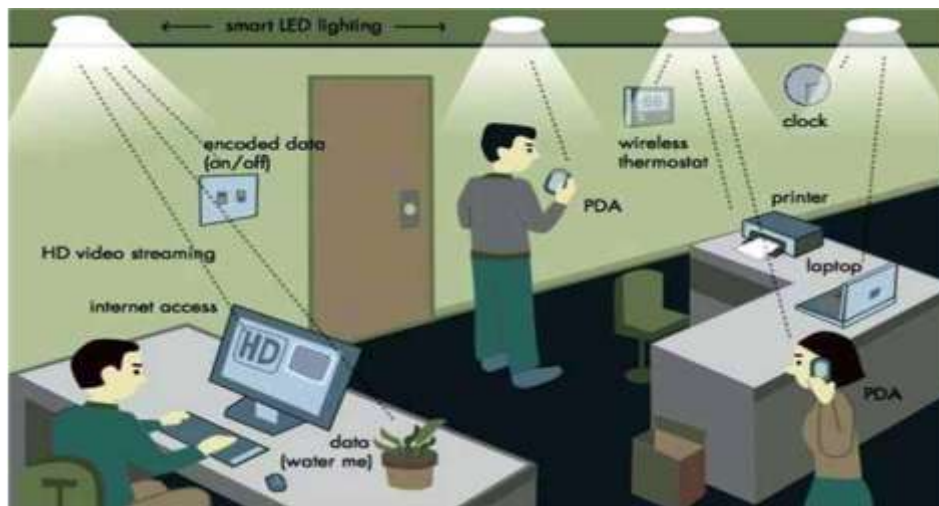
Fig1: LiFi in work place.

With continuously growing needs of telecommunication world, there's an increased thrust for higher bandwidth that facilitates faster and secure data transmission. Present telecommunication industry relies on radio waves of spectrum for data transmission. Inappropriately, the radio emission spectrum has certain key limitations: Capacity, Efficiency, Availability and Security. So using the sunshine Emitting Diodes that has within the transmission of knowledge much faster and reliable than the information which might be transmitted through Wi-Fi. Li-Fi could even be a wireless communication system during which light is employed as a carrier signal rather than traditional frequency as in Wi-Fi. Li-Fi technology communicates with the assistance of actinic ray Communication (VLC) spectrum and has no side effect, as we all know the sunshine is extremely much a part of our life then much faster Moreover, Li-Fi makes possible to possess a wireless Internet in specific environments, where Wi-Fi is not allowed because of interferences or security considerations.