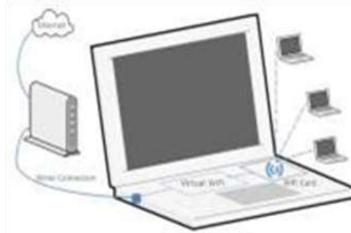
Fig4: Wired Connection

A single router may be used for data transmission in a small network. Larger network mostly use two or more routers and switches for data transmission.