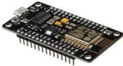
Fig - 1: Wi-Fi module

the patient. The activity of daily living actions are noted and trained to the sensor by SVM, in order to identify and detect the actual fall.