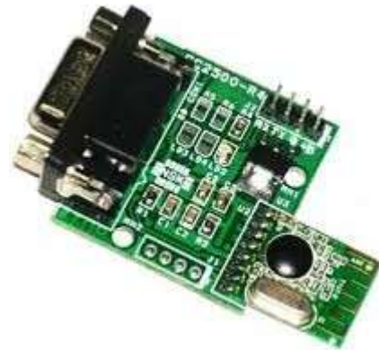
Fig - 1: Zigbee

Zigbee works at mesh networking technology each node within the network which is connected to each other. Zigbee has low power consumption and it is used in low data rate applications. The devices like Amazon echo plus Philips hue that supports the Zigbee protocol. Zigbee technology which transmits data over long distances by passing the information through a mesh network.