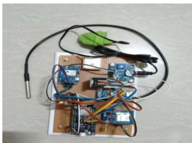
Fig -3 Proposed System