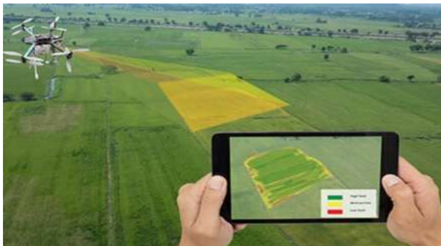
Figure - 3

Use of drones for irrigation applications is, again, two-fold. On one side, equipping UAVs with a variety of sensors and cameras can help to identify areas that are under water stress and conclude what irrigation changes are required. At the same time, they can be used for sprinkling water and pesticides on the crops precisely, especially in emergency cases, which would save both time and wastage. In multispectral images of citrus crops were acquired using the fixed-wing UAV, where the retrieved data was used to assess and detect structural and physiological changes in the targeted crop. Furthermore, UAVs are not only used to analyze the irrigation properties but also provide solutions by sprinkling water precisely over the water stress areas. Due to this application of UAVs, they are being considered the newest water-saving tool, while their use is helping not only to increase watering efficiency but also detect possible pooling or leaks in irrigation.