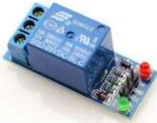
Fig 5. Relay Switch

The primary relays were employed in long distance telegraph circuits as amplifiers: they continual the signal returning in from one circuit and re-transmitted it on another circuit. Relay is employed to run a pumping motor in automatic farm observation. Arduino operates at 5V current. It's not capable to manage higher voltage devices directly. Arduino are corrupted if higher voltage device is connected with it. Relay has 3 high voltage terminals. They are: NC, COM, NO. These terminals connect with the device that we would like to manage. Relay has 3 low voltage pins. They are: GND, VCC, IN. These pins connect with the Arduino directly.