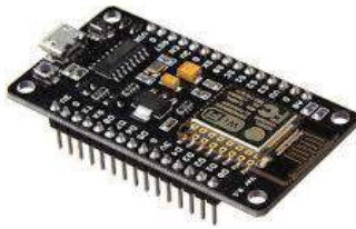
Fig 2. Node MCU (ESP8266)

ESP8266 Wi-Fi SoC from communicative Systems, and hardware that is predicated on the ESP-12 module.