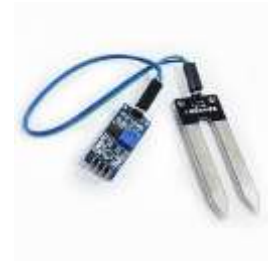
Fig 3. Soil wet detector

A straightforward soil wet detector for gardeners. Soil wet sensors live the meter water content in soil. The Soil wet detector uses capacitance to live stuff permittivity of the encompassing medium. In soil, stuff permittivity may be a perform of the water content. The detector creates a voltage proportional to the stuff permittivity, and thus the water content of the soil. Wet detector measures the soil wet and sends it to the Arduino within the kind of information. The relation between the measured property and soil wet should be graduated and will vary betting on environmental factors like soil kind, temperature, or electrical conduction. Mirrored microwave radiation is suffering from the soil wet and is employed for remote sensing in geophysics and agriculture. Transportable probe instruments may be utilized by farmers or gardeners.