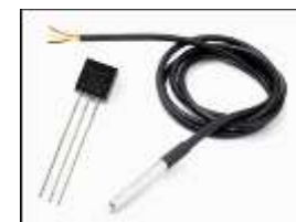
Fig 4 . Ds 18B20

The detector works with the tactic of 1-Wire communication. It needs solely the information pin connected to the microcontroller with a pull up electrical device and therefore the alternative 2 pins square measure used for power. The pull-up electrical device is employed to stay the road in high state once the bus isn't in use. The temperature worth measured by the detector are hold on in a very 2-byte register within the detector. This information may be browse by the victimization the 1-wire technique by causing in a very sequence of knowledge. There square measure 2 sorts of commands that square measure to be sent to browse the values, one may be a storage command and therefore the alternative is perform command. This detector connected with the Arduino and it provides the information to the Arduino from the soil. Power offer vary is three. 0V to 5. 5V.