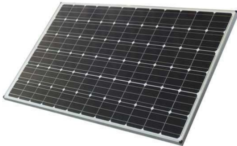
Fig. 2 solar module

Also called solar panels, a solar module may be a single photovoltaic panel that's an assembly of connected solar cells. The solar cells absorb sunlight as a source of energy to get electricity. An array of modules is wont to supply power to buildings. A solar module is generally consisting of an assembly of 6x10 solar cells. The solar cells' efficiency and wattage output can vary counting on the sort and quality of solar cells used. A solar module can home in energy production from 100-365 Watts of DC electricity. The higher is the wattage output, the more energy generation per solar module. A solar battery of modules consisting of upper energy-producing solar modules will, therefore, produce more electricity in less space than an array of lower producing modules. However, the cost is higher for greater producing modules.